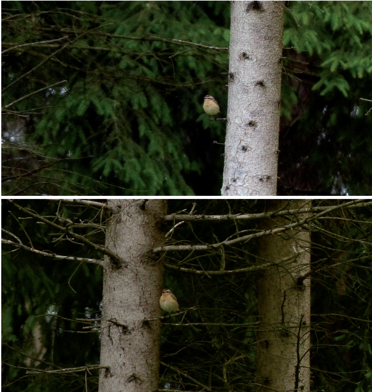
Fig. 2: Both pictures show the female Whinchat in the spruce forest.

In the same year there was a special breeding constellation of Whinchats with a Stonechat ( Saxicola torquata ) which took function as a breeding helper (FEULNER et al 2016), so I took a lot of time for making observations in the area. It was remarkable how often foxes Vulpes vulpes were looking for food in the Teuschnitzaue even during the day. But it must remain speculation whether the Whinchat pair fled to the spruce forest to save his